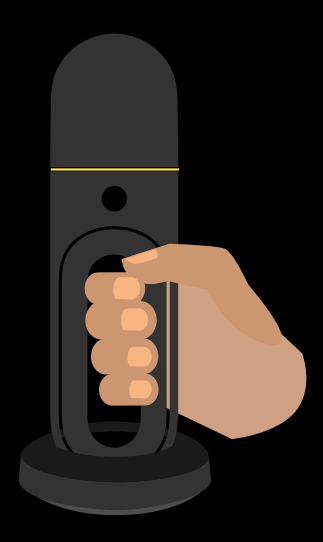
2. While initializing (LED blinking yellow) hold the device stable on the table stand.