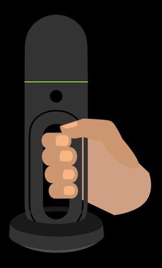
3. Take the device and start walking only when the initialization has finished and the LED turns green.